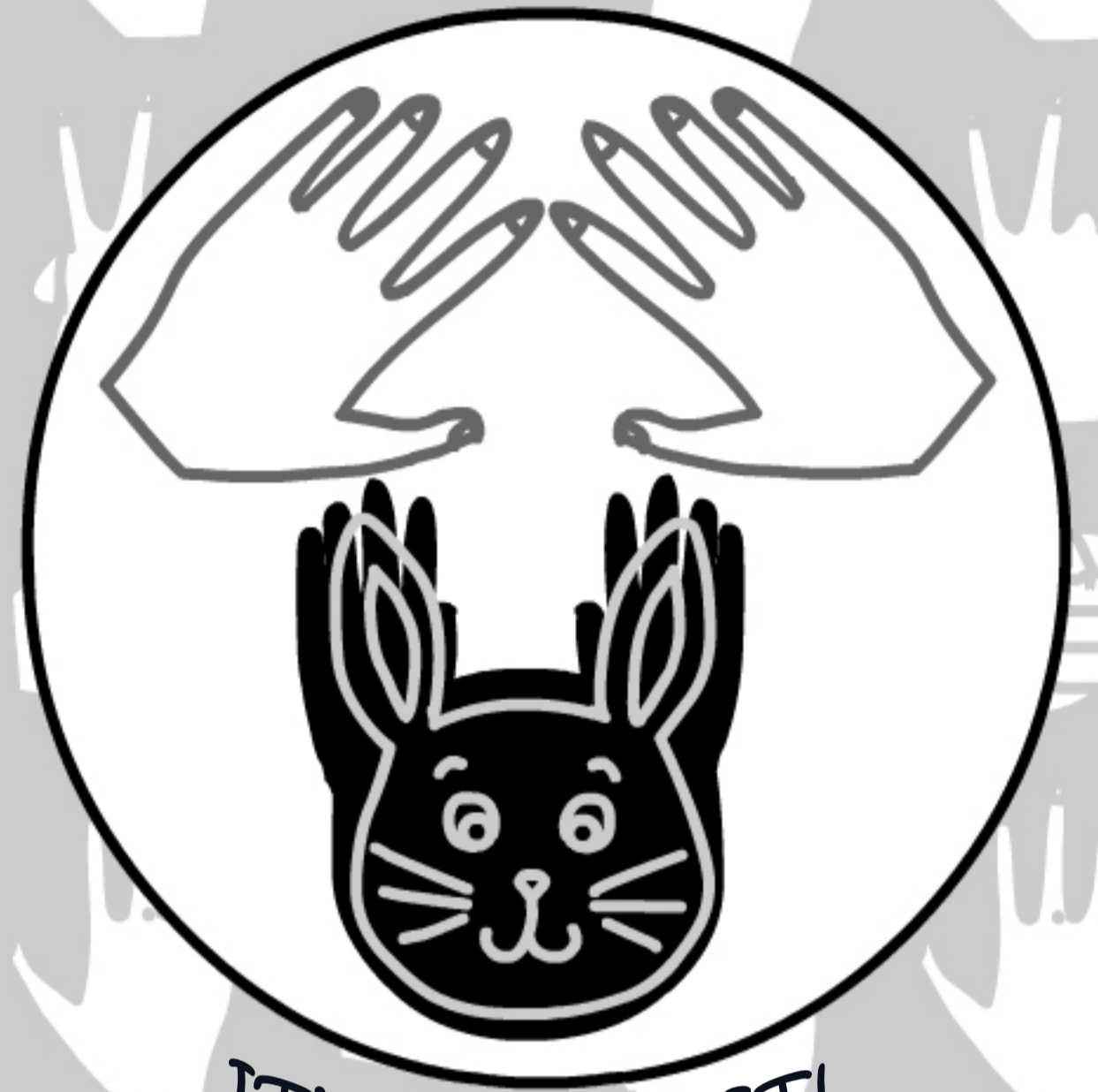
IT'S A RABBIT!