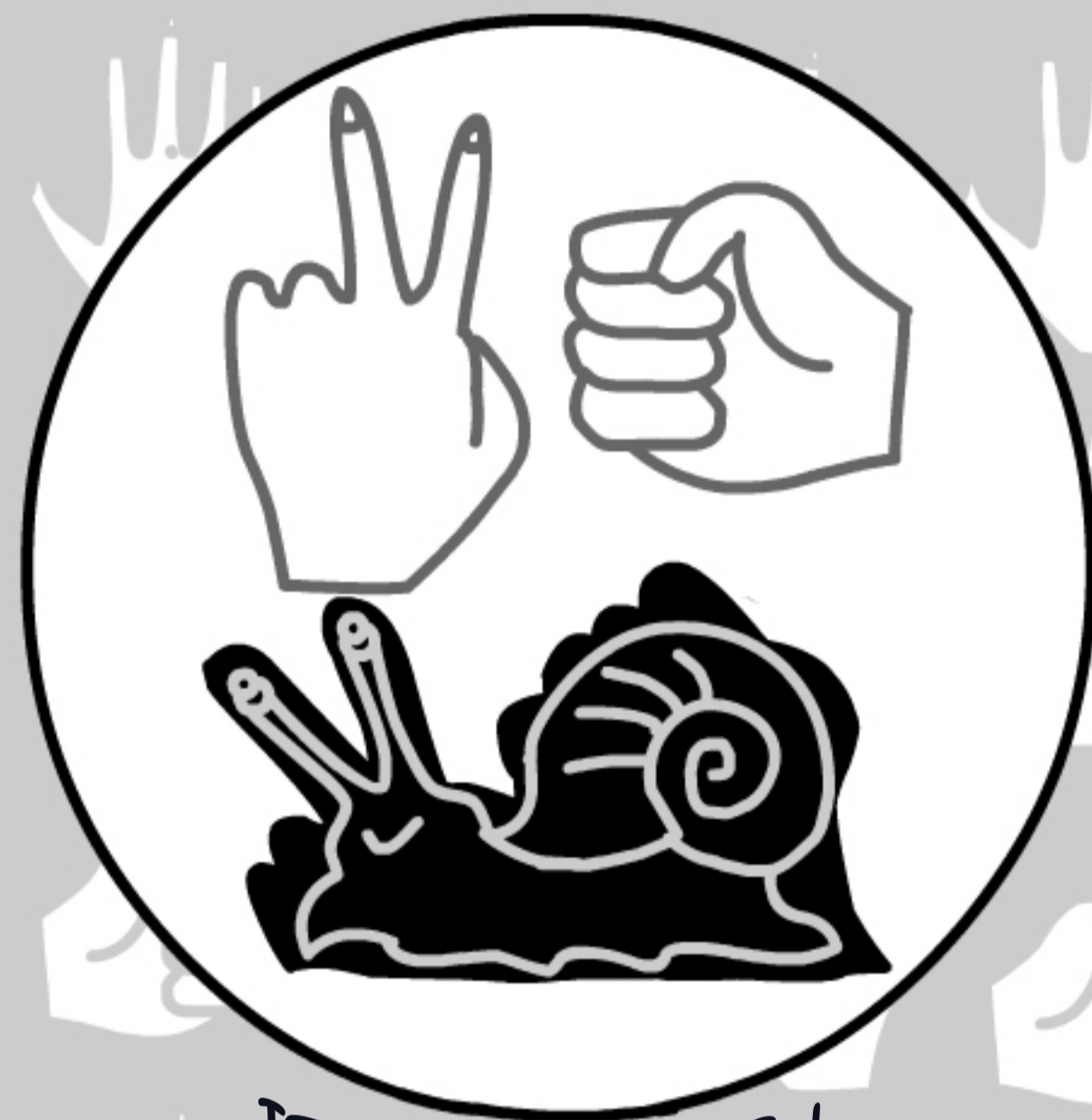
IT'S A SNAIL!