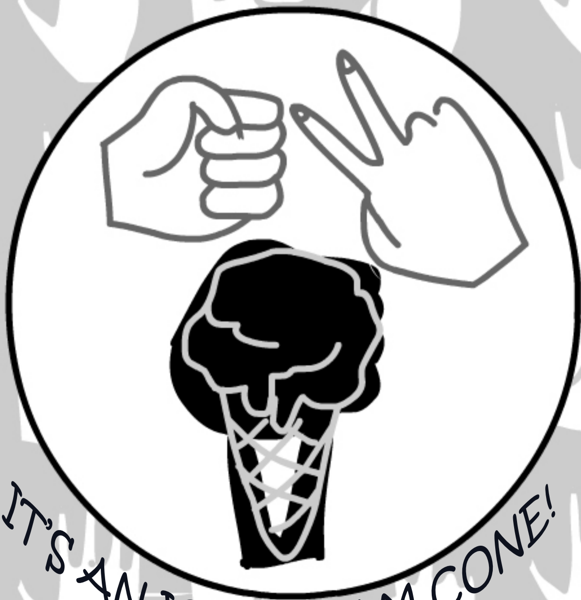
IT'S AN ICE CREAM CONE!