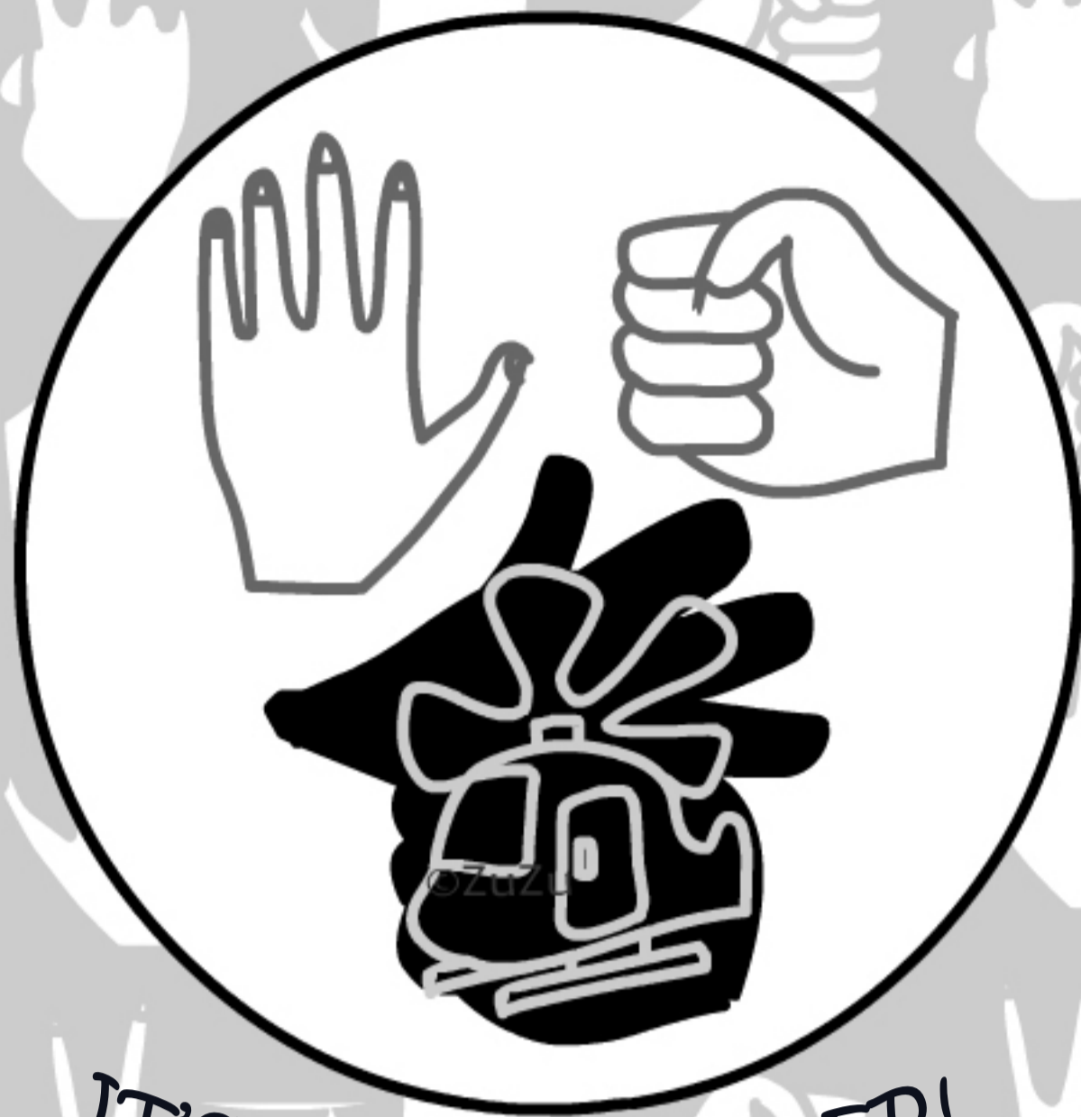
IT'S A HELICOPTER!