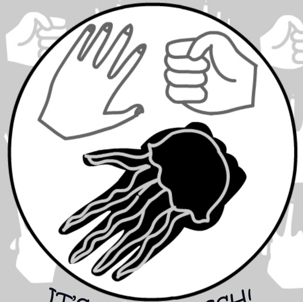
IT'S A JELLYFISH!