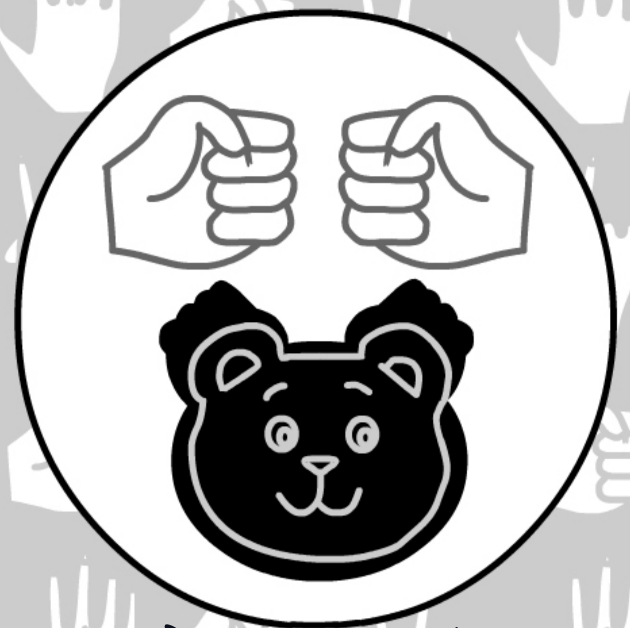
IT'S A BEAR!