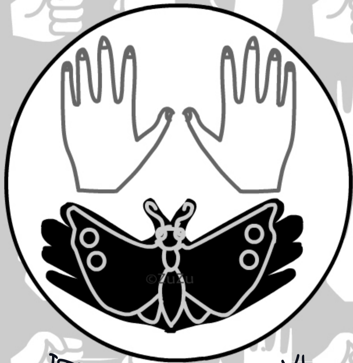
IT'S A BUTTERFLY!