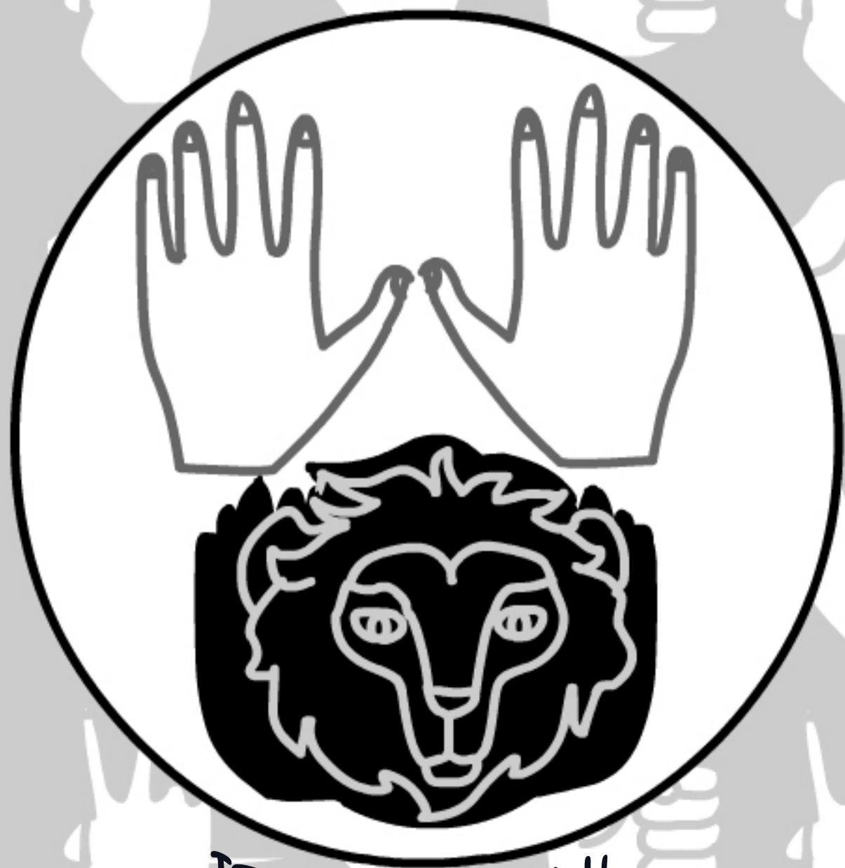
IT'S A LION!