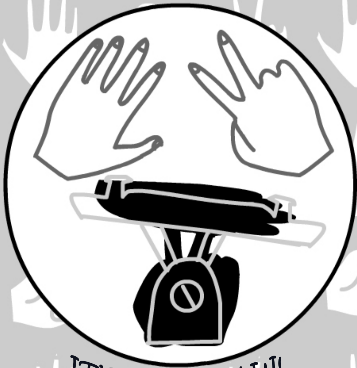
IT'S A SEESAW!