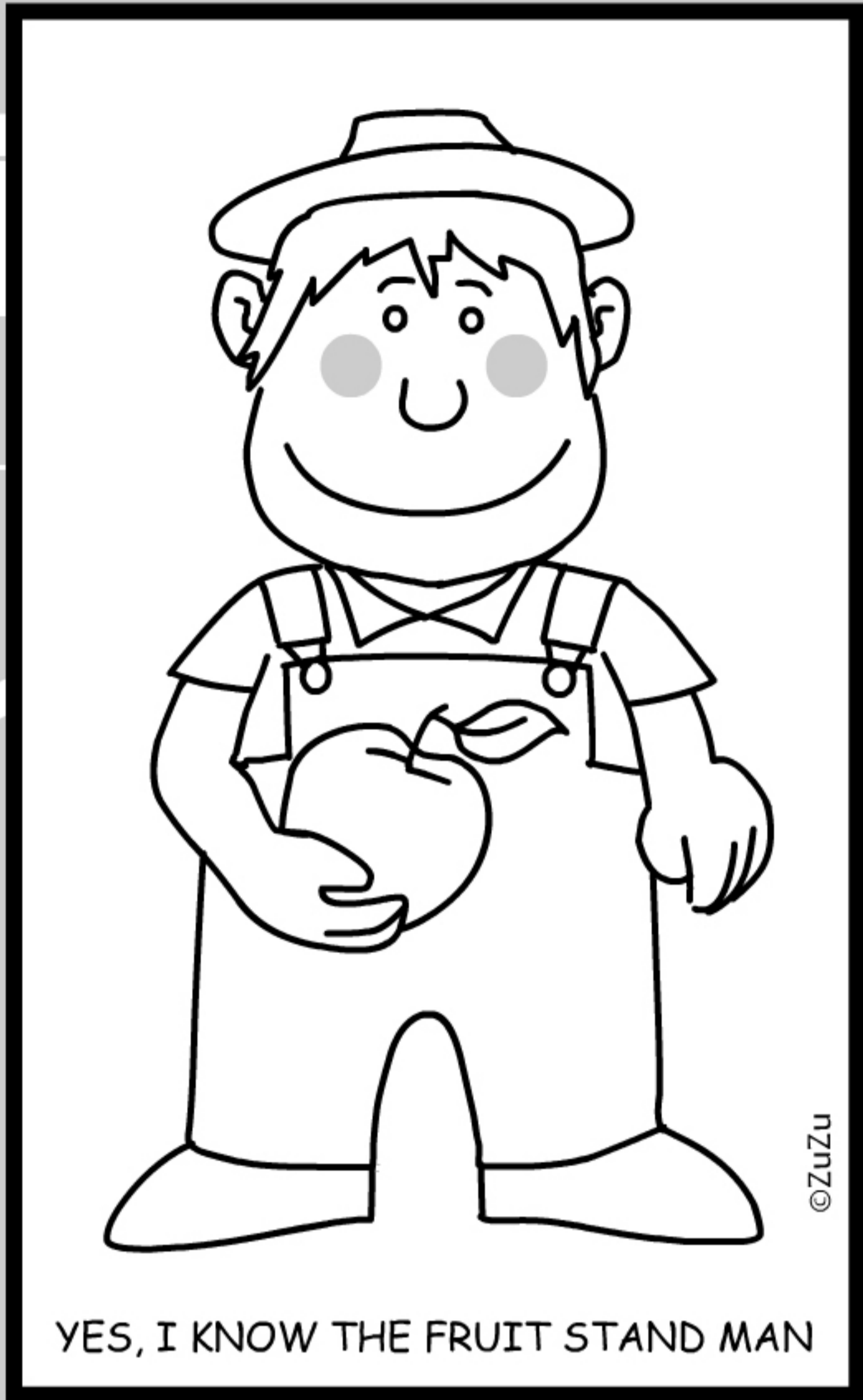
YES, I KNOW THE FRUIT STAND MAN